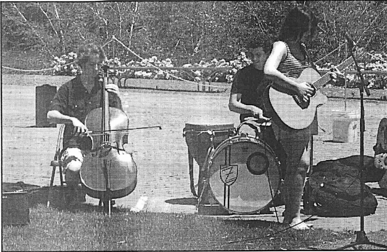
Above, musicians performed at the First Annual Malden River Festival. Below, kids took advantage of the fitness bikes to see how to get in shape.